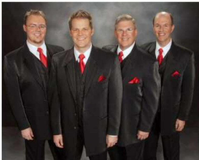
Johnny Appleseed District Champions 2011 BHS International 18th Place Quartet